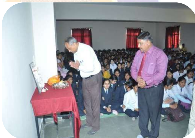
Lamp lightening ceremony at the hands of Chief Guest: 2016-17