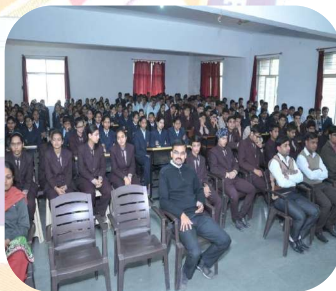
Road Safety Programme- 2015-16