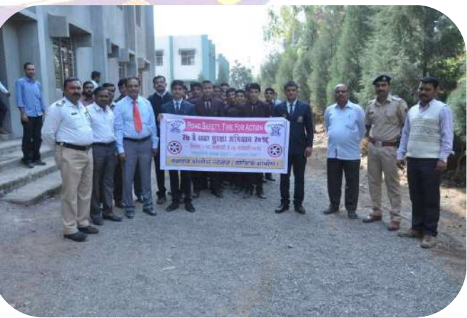
Road Safety Programme- 2015-16