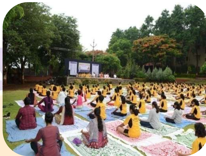
Participation of Staff in Yoga Day: 2016-17