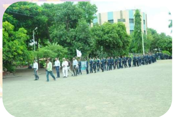
Tree Awareness Rally 2017-18