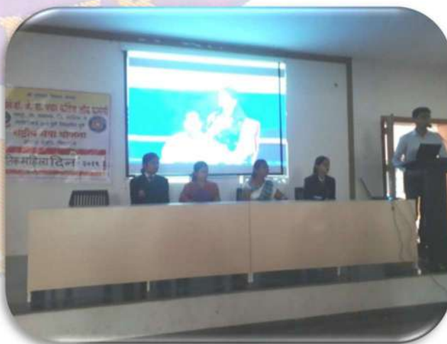
World Women's Day Celebration 2018-19