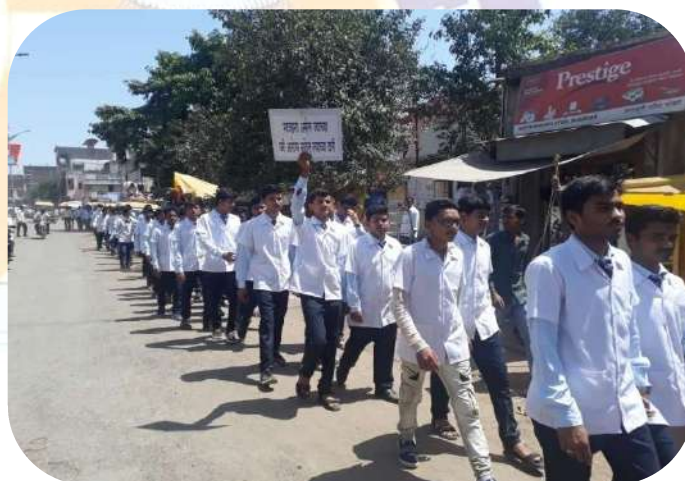
Swacchata Hich Seva Abhiyan 2018-19