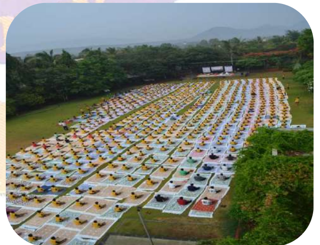
Participation in the Yoga Day: 2016-17