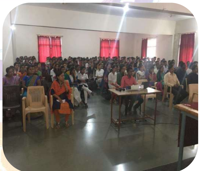
Programme Inaugurated with hands of all ladies staff members (2017-18)