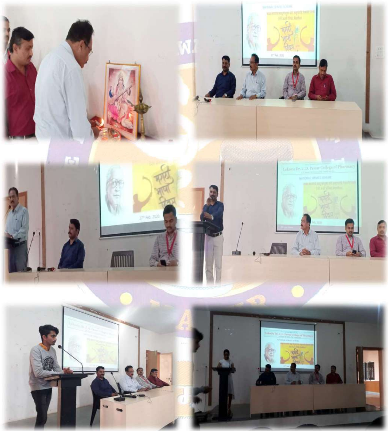
Marathi Bhasha Gaurav Din 2019-20