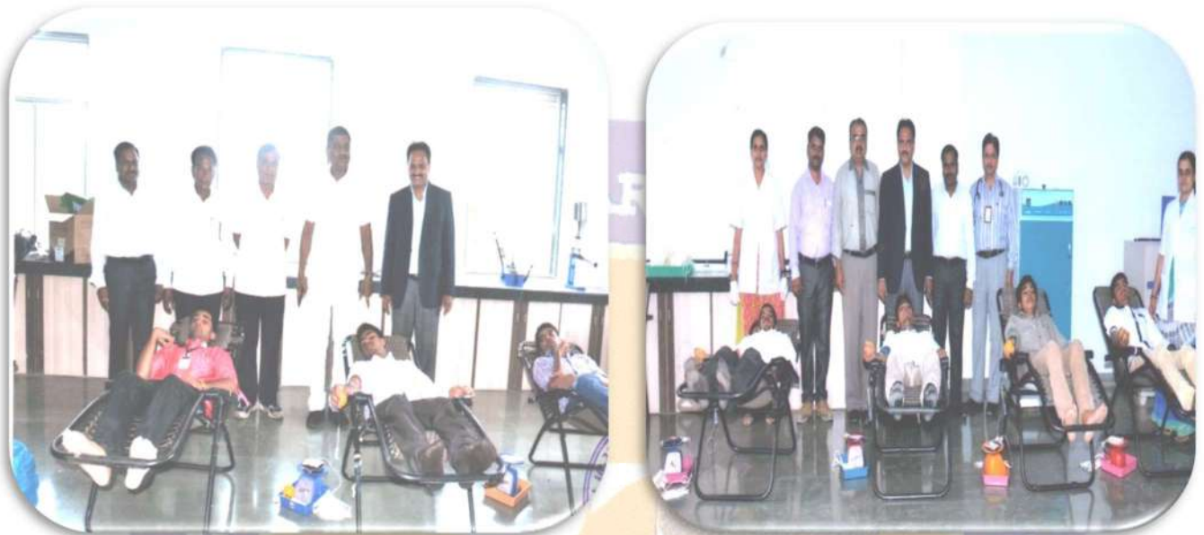
Blood Donation Camp: 2015-16 (23/07/2015)