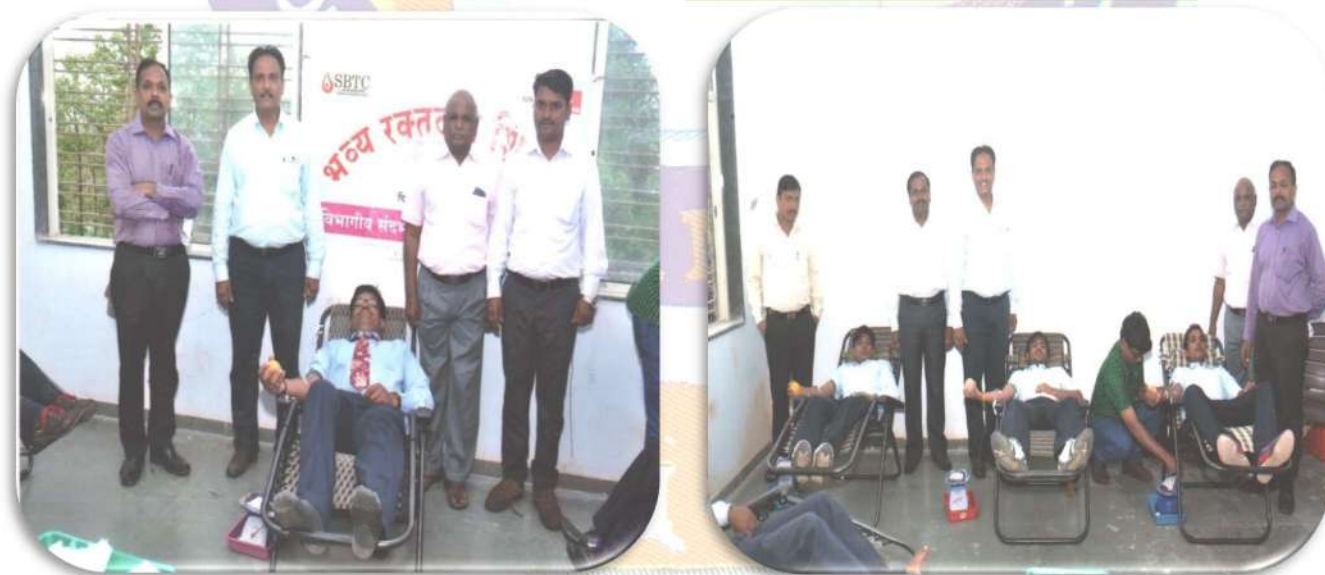
Blood Donation Camp: 2014-15 (23/07/2014)