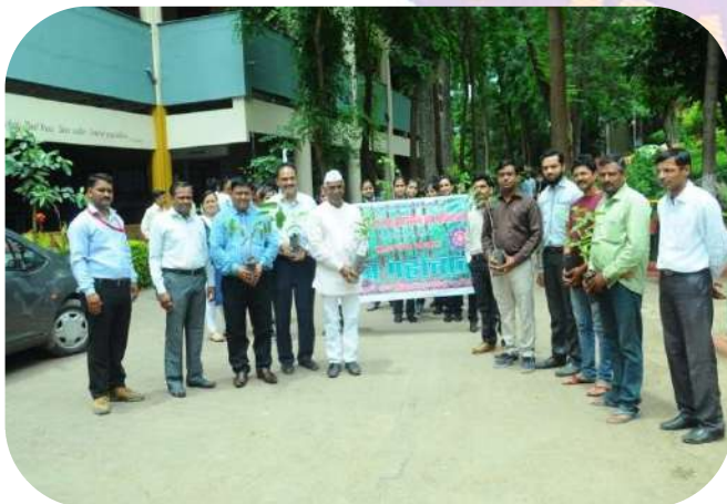
Vruksha Dindi 2017-18