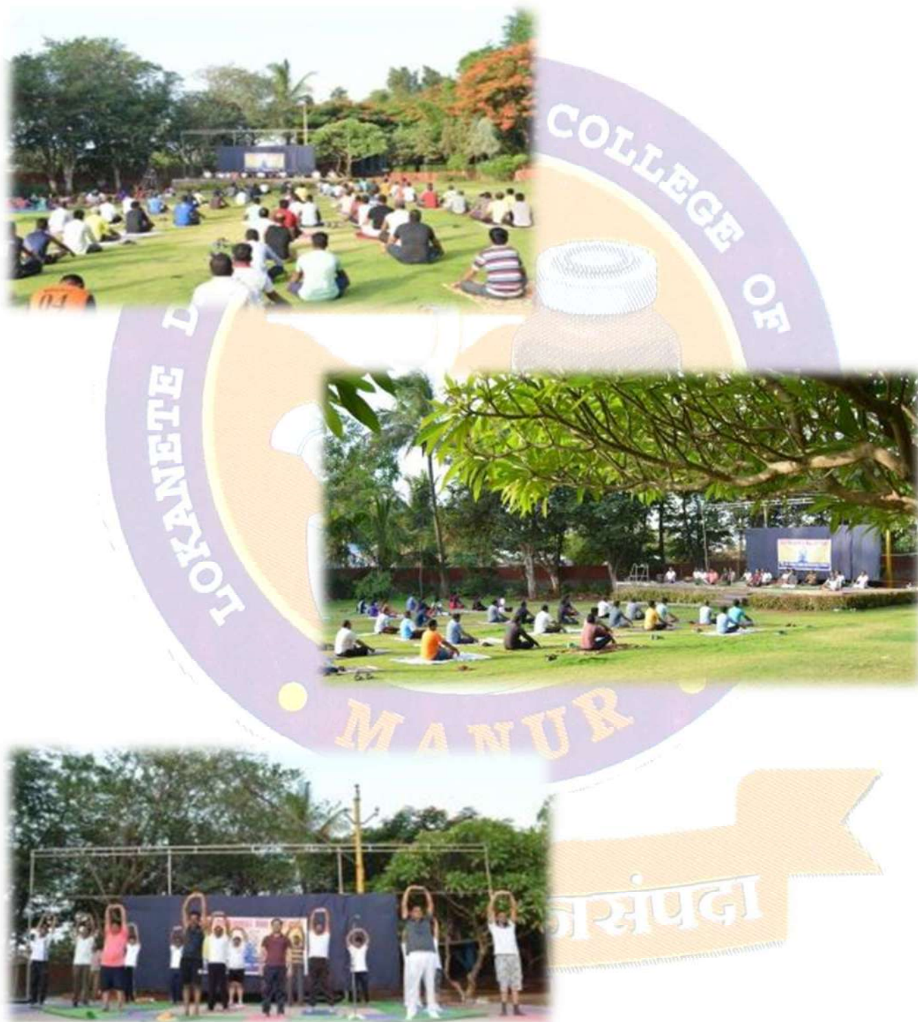
Staff participated in International Yoga Day Celebration: 2019-20