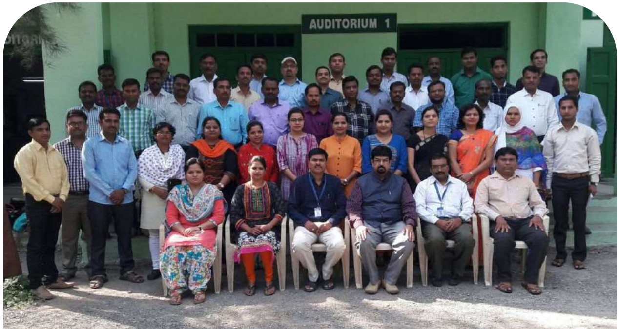
127 th Batch of NSS Orientation Course conducted at ETI BPHE Ahmednagar College