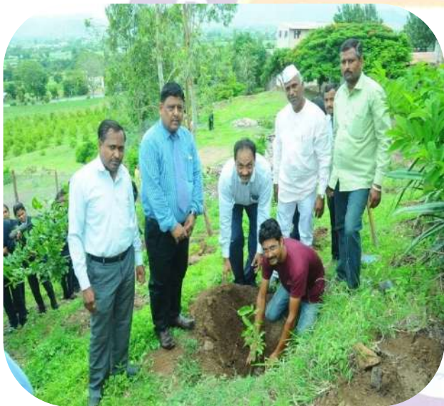
Manur Hill 2017-18