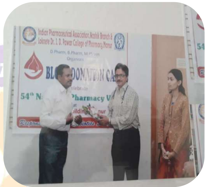
Blood Donation Camp on the occasion of National Pharmacy Week- 2015-16