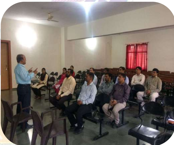
Stress Management & Meditation Camp (2017-18)