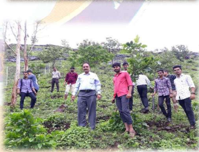
Tree Plantation 2019-20