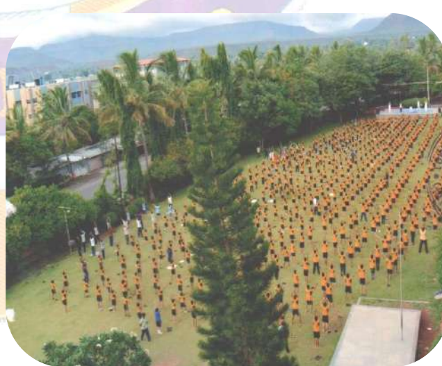
First International Yoga Day: 2015