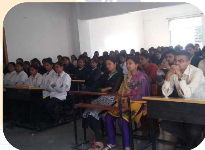
Students of B. Pharmacy presented their views (2015-16)