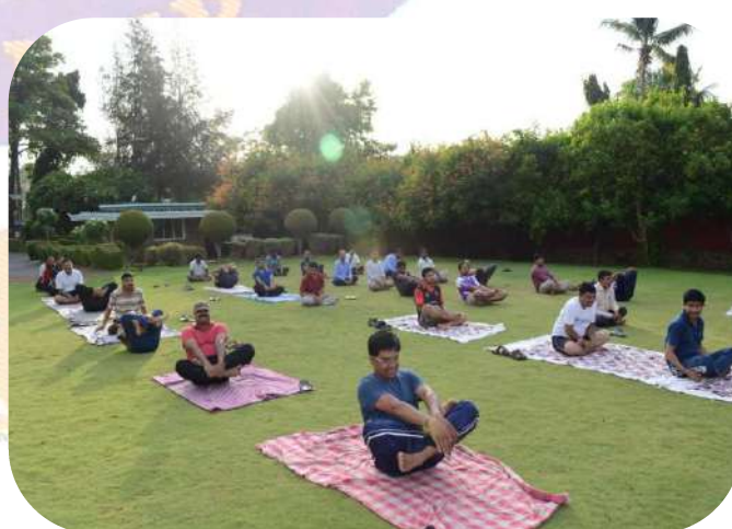
Students & Staff participated in International Yoga Day Celebration: 2017-18