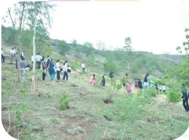
Student Participation in Tree plantation: 2016-17