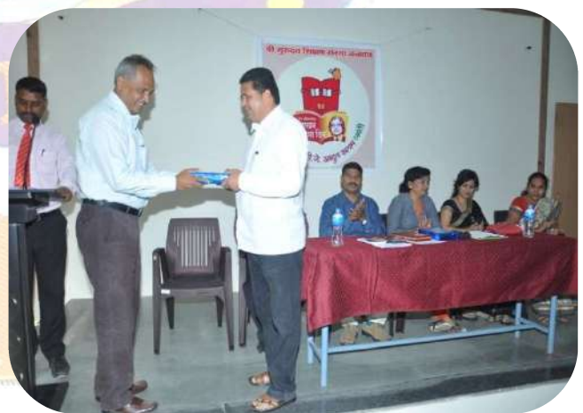
Felicitation of winner in Essay writing competition by the hands of Chief Guest: 2016-17