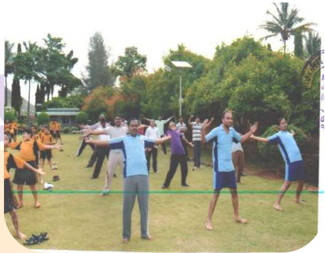
First International Yoga Day: 2015