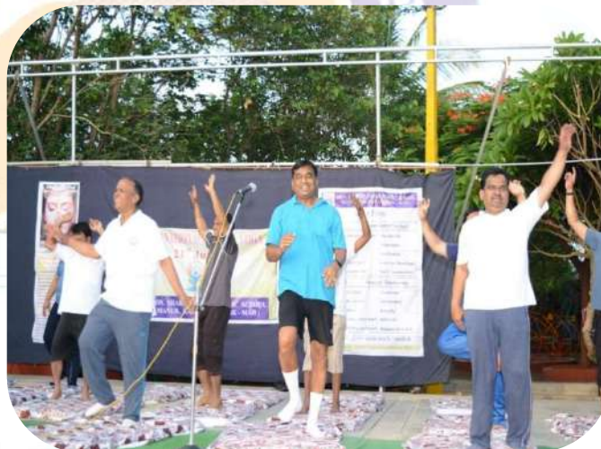
Third International Yoga Day Celebration: 2017-18