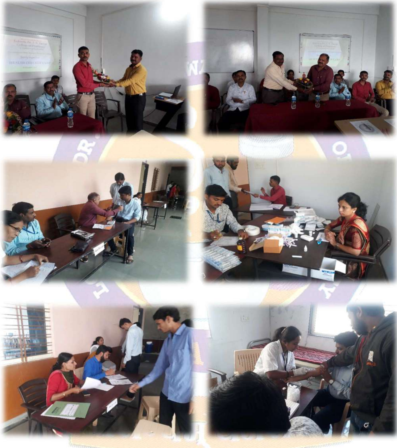
Health Checkup Camp 2019-20