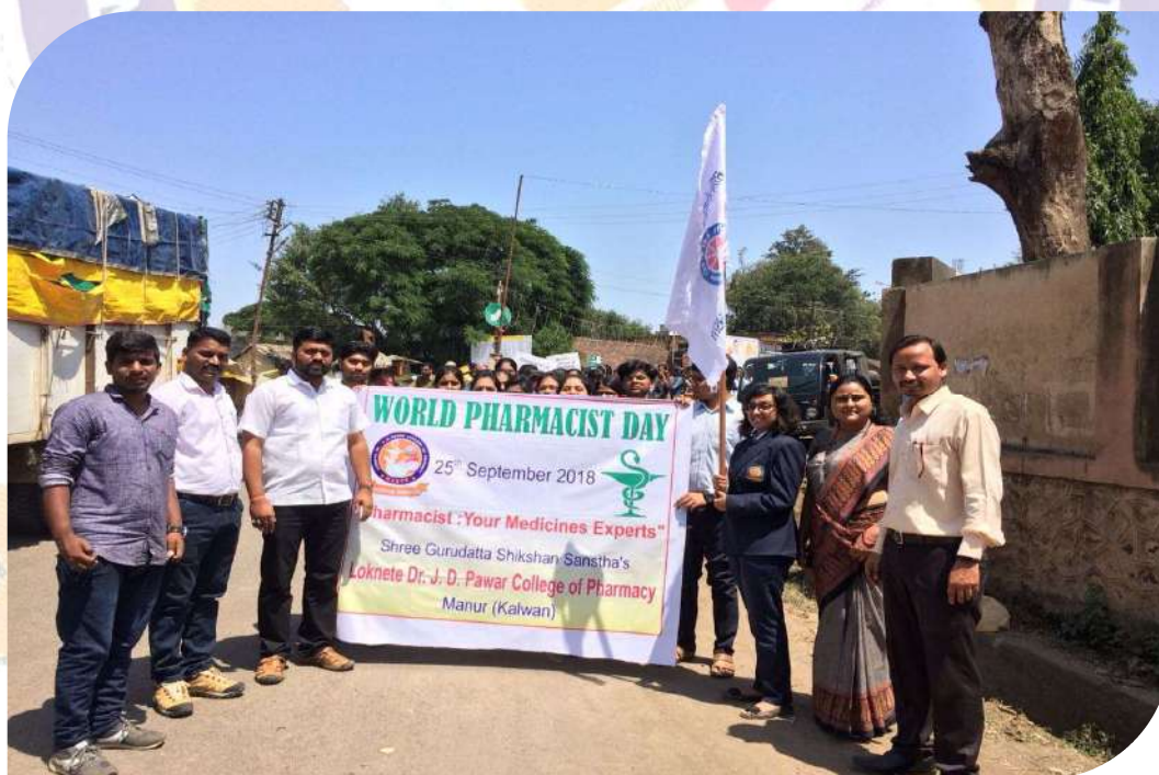
World Pharmacist Day Celebration 2018