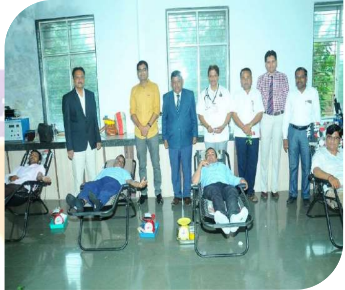
Blood Donation Camp: 2017-18 (23/07/2017)