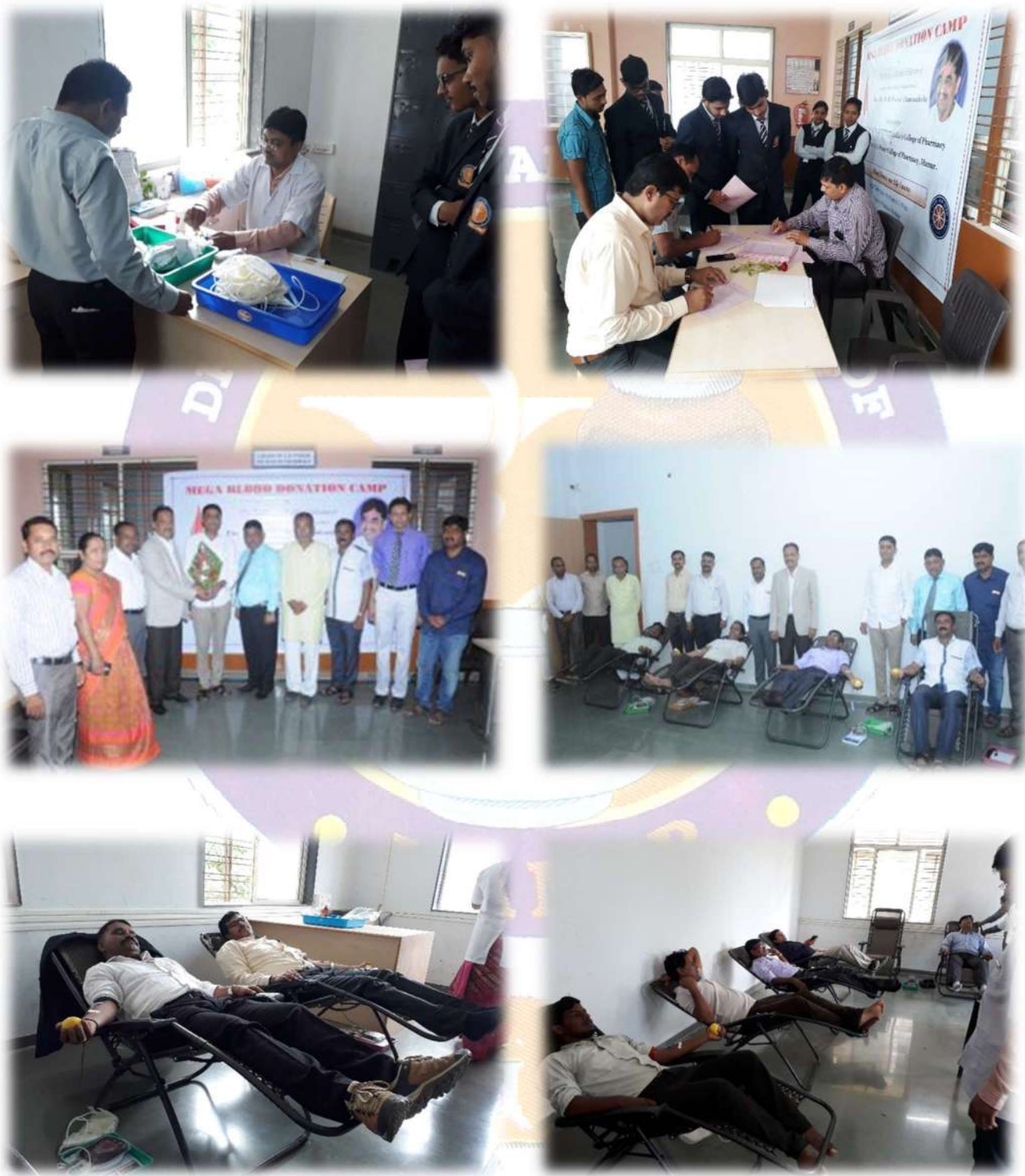
Blood Donation Camp: 2019-20