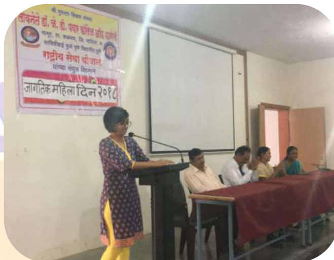
Students and staff presented their views on this occasion (2017-18)