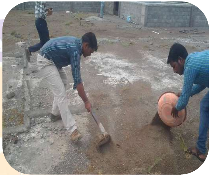
College Terrace Cleaning (2014-15)