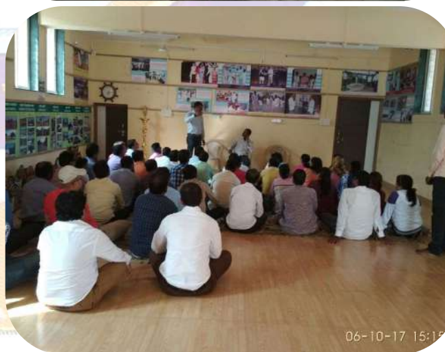
Visit to Hivare Bazar Villeg, Ahmednagar