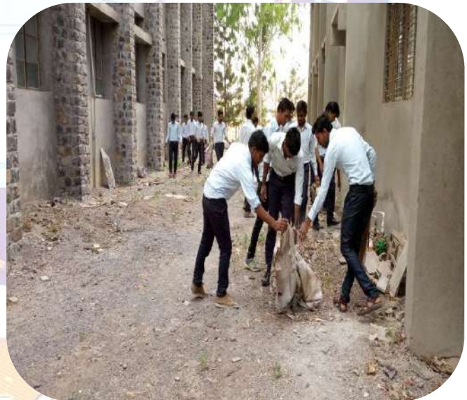
College Campus Cleaning