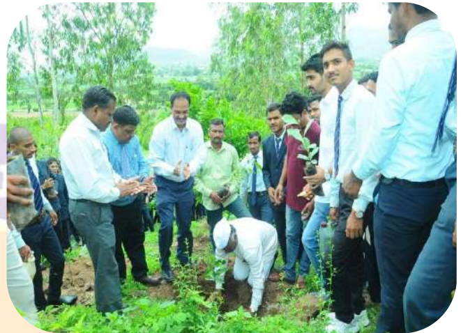
Manur Hill 2017-18