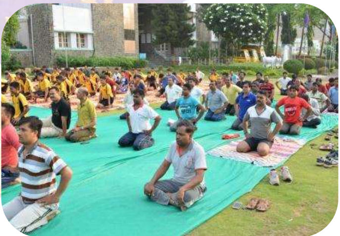
Students & Staff participated in International Yoga Day Celebration: 2018-19