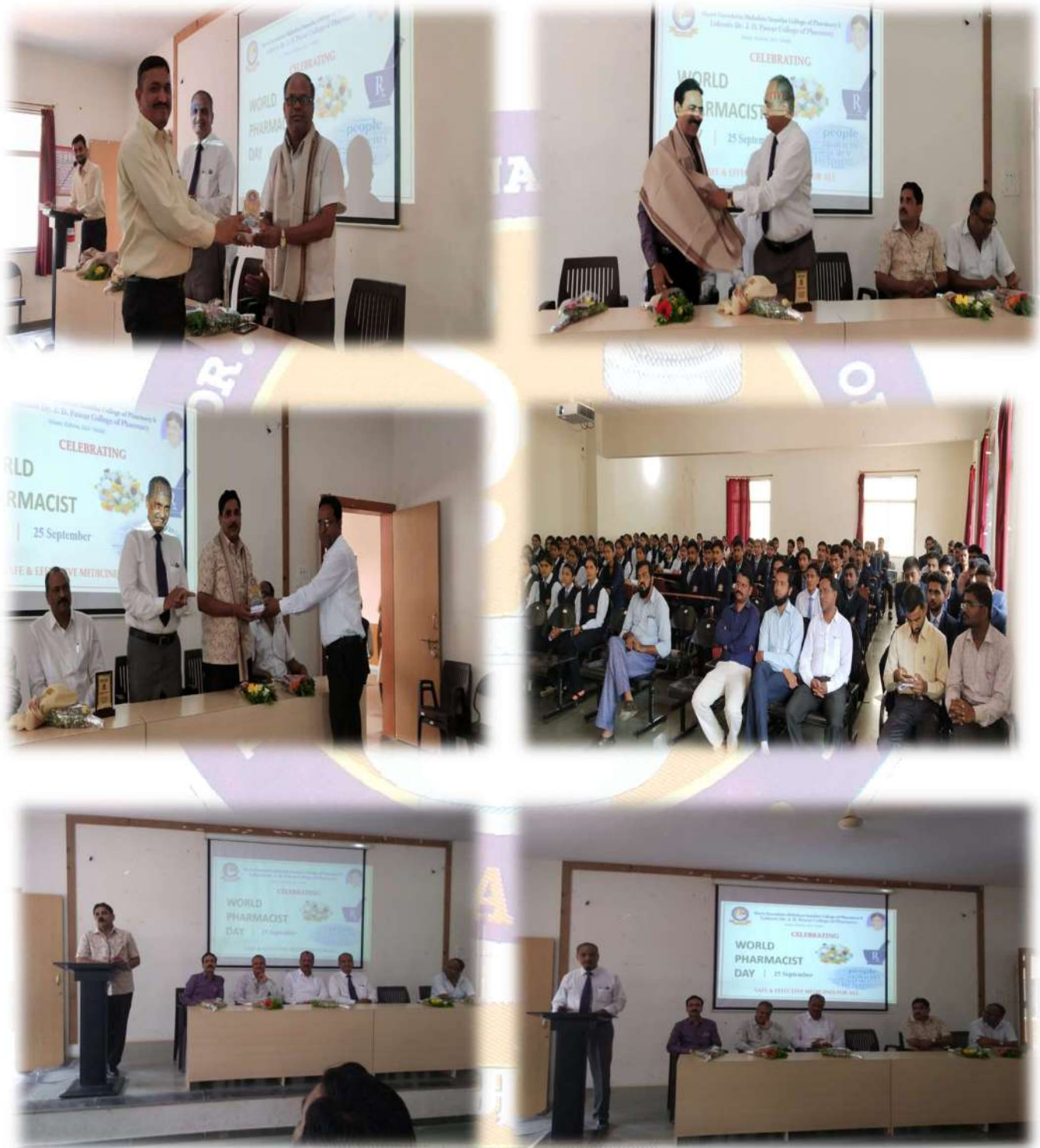
World Pharmacist Day Celebration 2019 (By felicitating community Pharmacist)