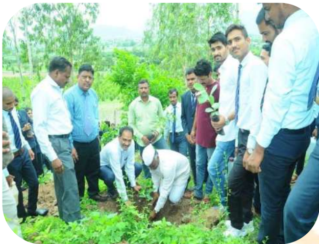
Manur Hill 2017-18