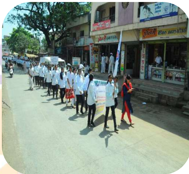
World Pharmacist Day Celebration 2017