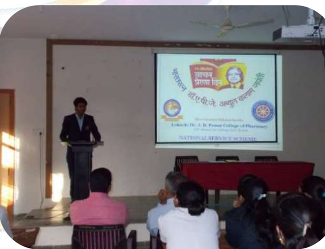
Dr. A. P. J. Abdul Kalam Birth Anniversary Celebration 2018-19