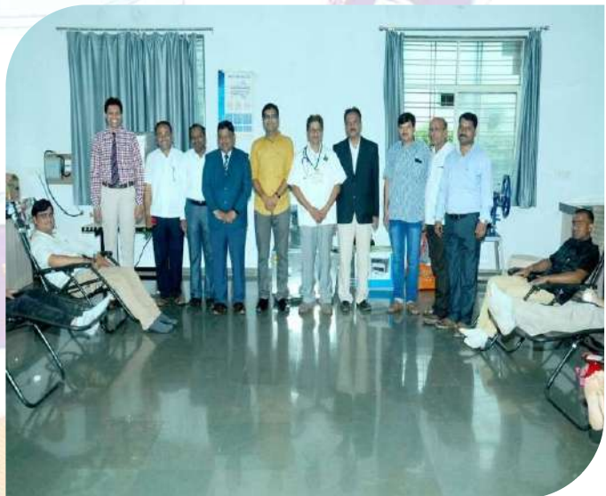
Blood Donation Camp: 2017-18 (23/07/2017)