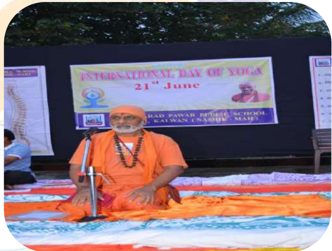
Second International Yoga Day Celebration: 2016-17