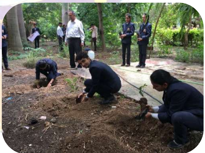
Vruksha Dindi & Tree Plantation 2018-19