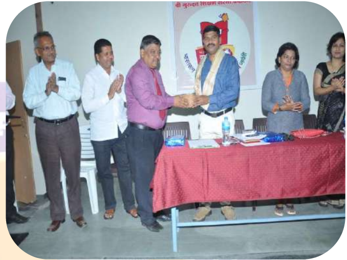
Poetry Reading by Hon. Kailas Chawade: 2016-17