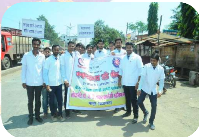
Swacchata Hich Seva Abhiyan 2017-18