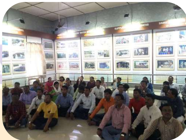
Visit to Anna Hajare Villeg Ralegansiddhi Village, Ahmednagar