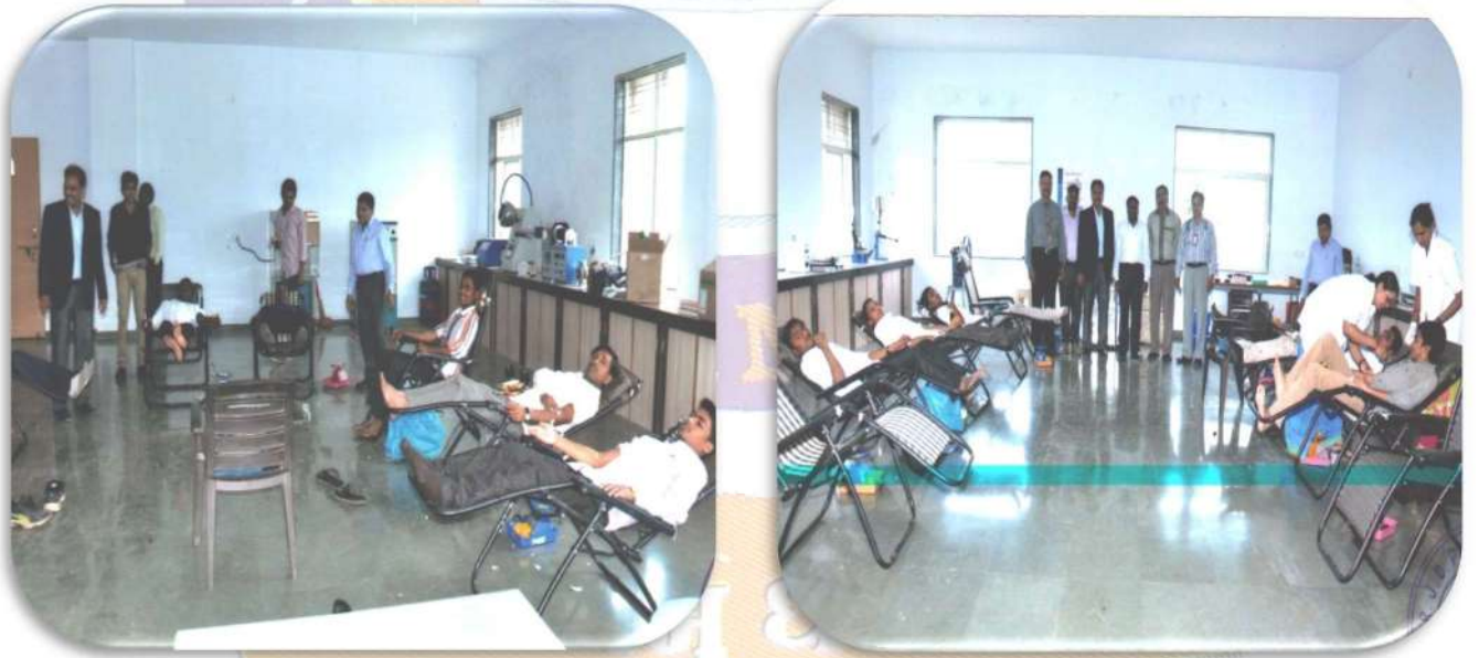
Blood Donation Camp: 2015-16 (18/01/2016)