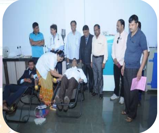
Blood Donation Camp: 2018-19 (21/07/2018)