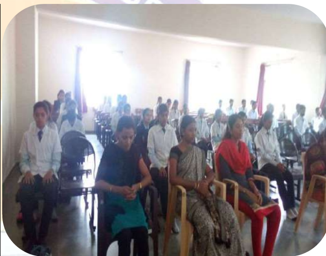
Meditation Camp (2016-17)